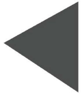
TABLE OF CONTENT